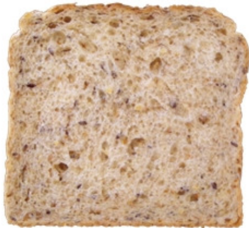
Wholemeal or multigrain