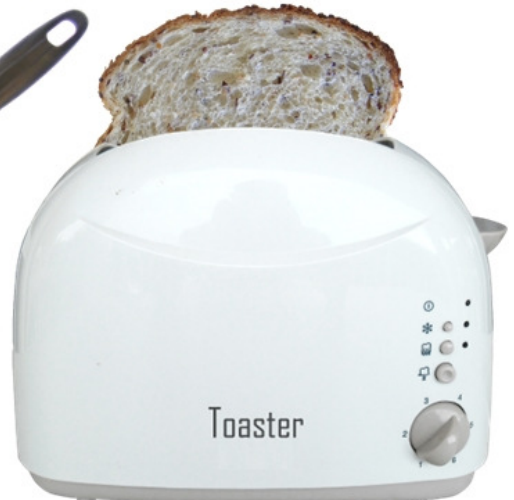
5 Toast the bread

You can have a very small amount of salt