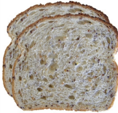
2 slices of multigrain or wholemeal bread