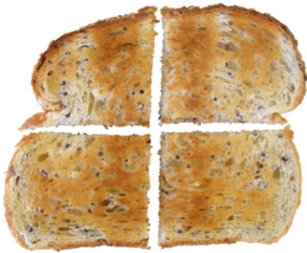
6 Cut the toast into 4