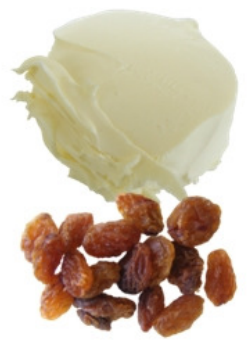
3 Get the cheese & sultanas