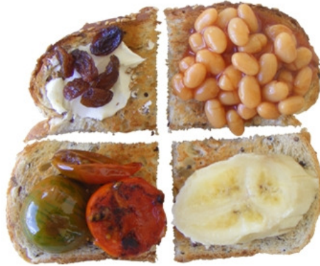
7 Make 1 set of vegetable & fruit small toast pieces you can try