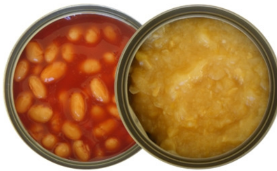
2 Open the tinned baked beans & creamed corn