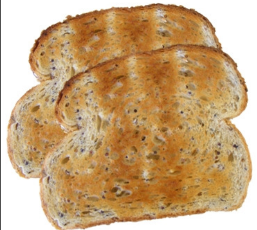
2 serves of multigrain or wholemeal bread