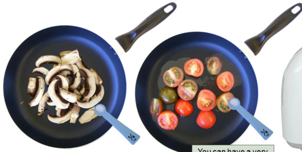
4 Cook the mushrooms & tomatoes

You can have a very small amount of salt