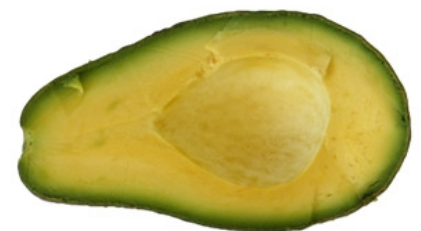
1 serve of avocado