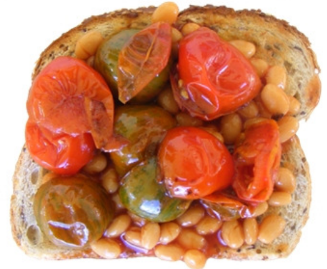
8 Make 1 large vegetable & fruit on toast using the topping you like best