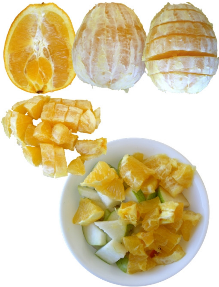
3 Add diced orange