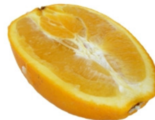
½ serve of fruit