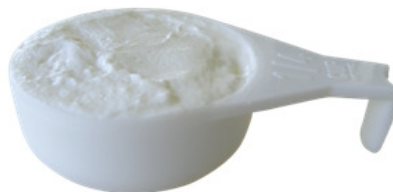
¼ cup low fat natural yogurt