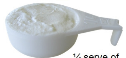
¼ serve of dairy