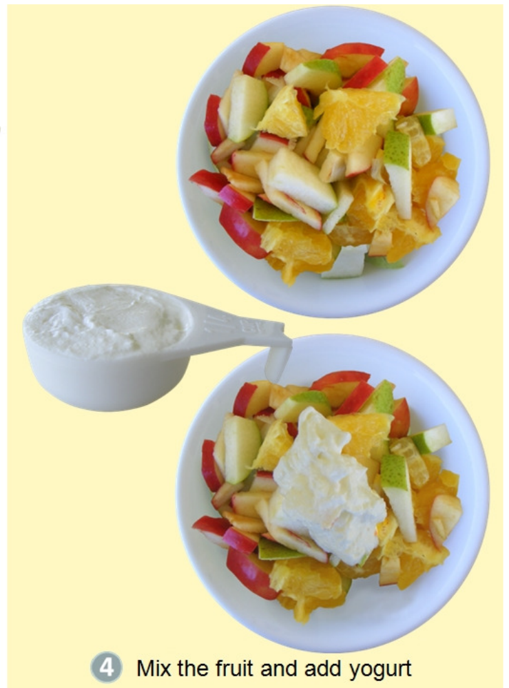
4 Mix the fruit and add yogurt