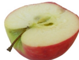
½ serve of fruit