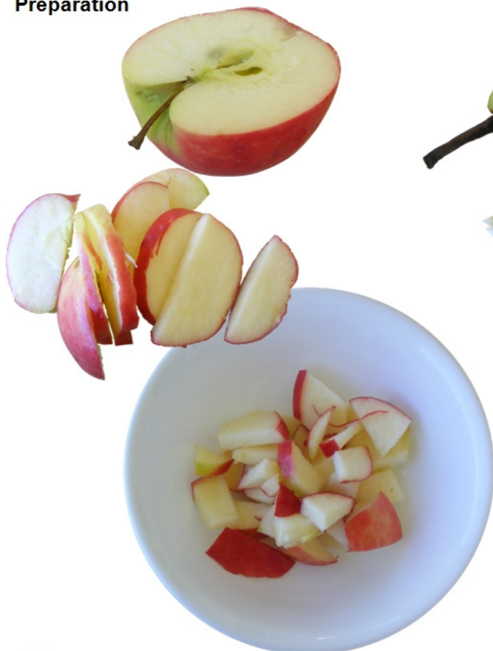
1 Add half a sliced apple