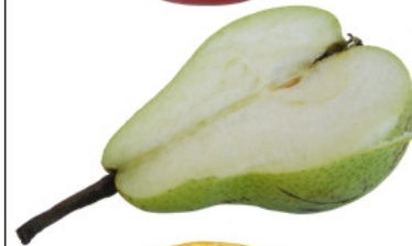
½ serve of fruit