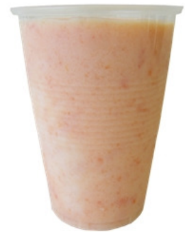
6 Pour into a cup