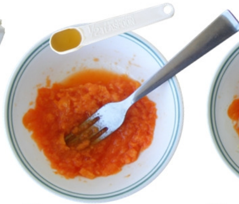
2 Add ½ teaspoon of honey