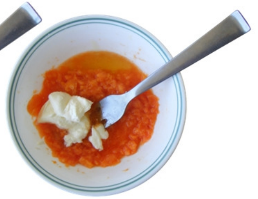
3 Add 1 tablespoon of yoghurt