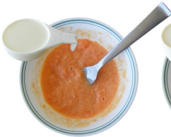
4 Add ¼ cup of milk