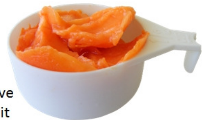
½ serve of fruit