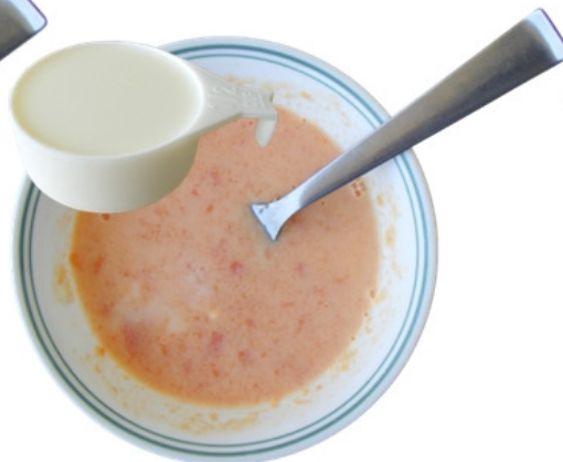
5 Add ½ cup of milk and mix