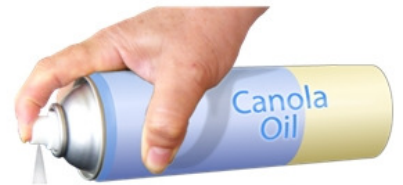
canola oil spray