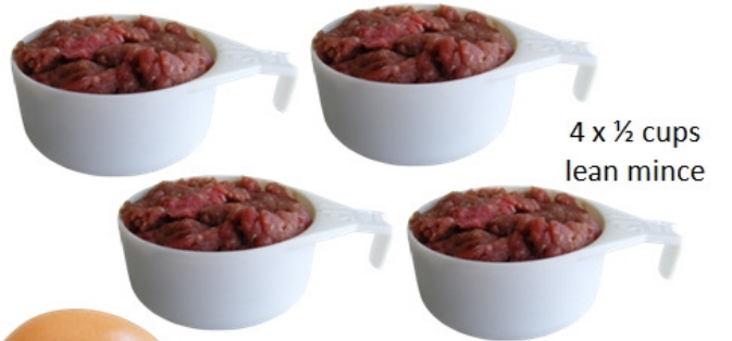
4 x 1/2 cups lean mince