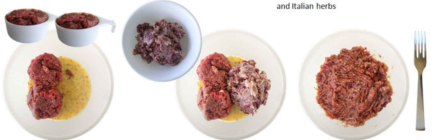
5 Add meat