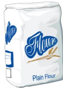
Flour for dusting