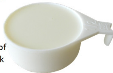
½ serve of light milk