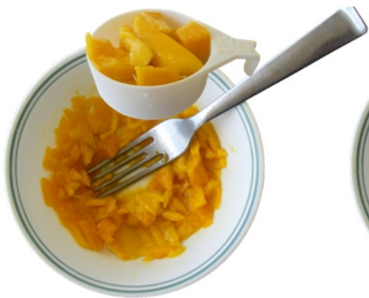
1 Place ½ cup of fresh mango in a bowl