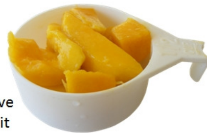
½ serve of fruit