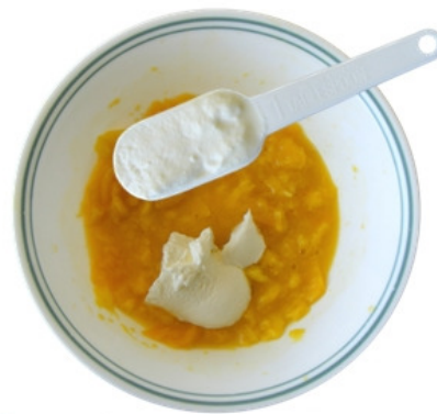
3 Add 1 tablespoon of yoghurt