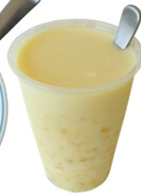
7 Pour into a cup