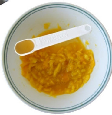
2 Add ½ teaspoon of honey