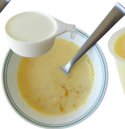
6 Add ½ cup of milk and mix