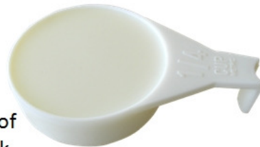
¼ serve of light milk