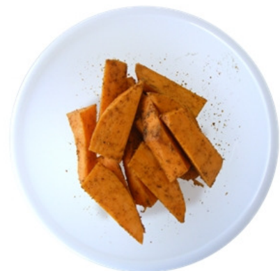
5 Mix and rub the oil & spice mixture with your hands