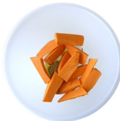
4 Add sweet potato wedges