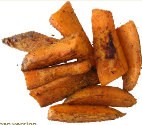
Frying pan version