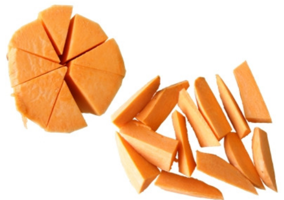
2 Chop sweet potatoes into wedges