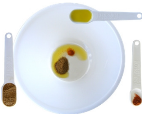
3 Add oil, curry powder & chilli powder if you want