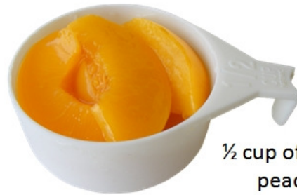
½ cup of tinned peaches