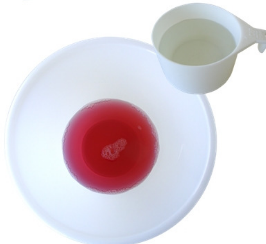
Add ¾ cup of cold water