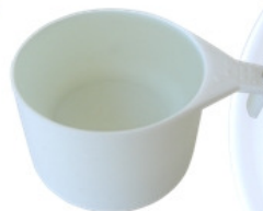
Add 1 cup of boiling water