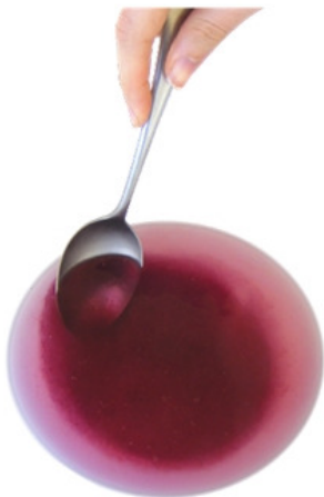
Stir until dissolved