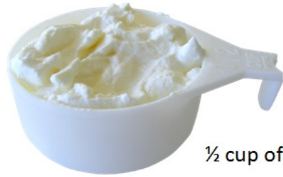
½ cup of yogurt