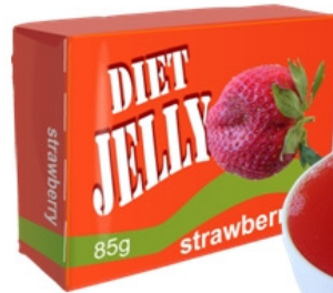
¼ cup of diet jelly