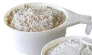
4 serves of cereal