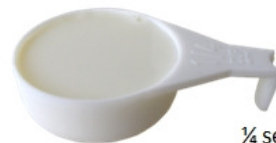
1/4 serve of milk