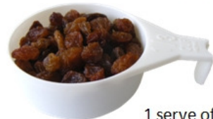
1 serve of dried fruit