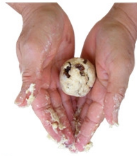
11 Roll in balls