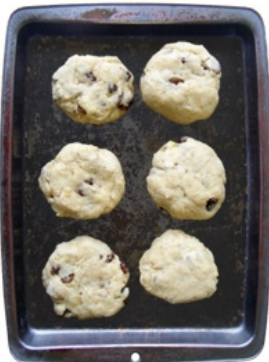
13 Place on tray