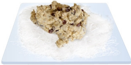
9 Place mixture on board dusted with flour