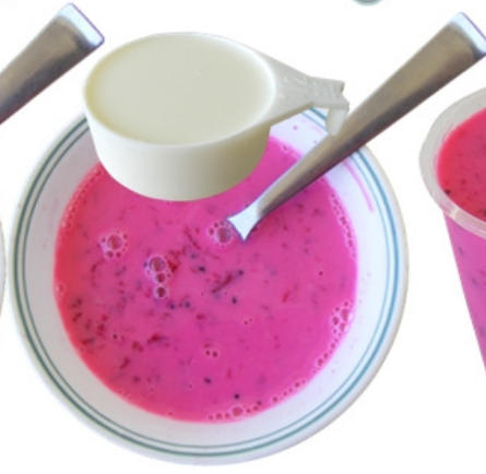
6 Add ½ cup of milk and mix