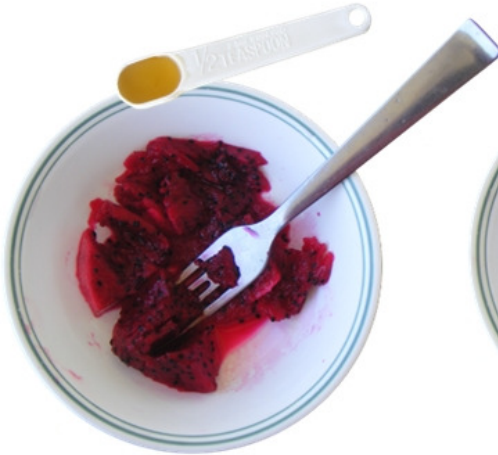
2 Add ½ teaspoon of honey