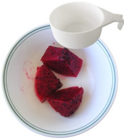
1 Place ½ cup of dragon fruit in a bowl