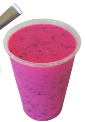
7 Pour into a cup