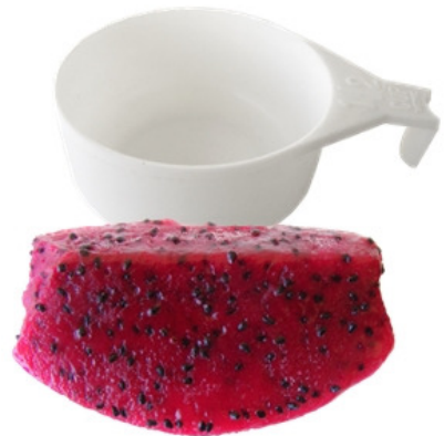
½ serve of fruit