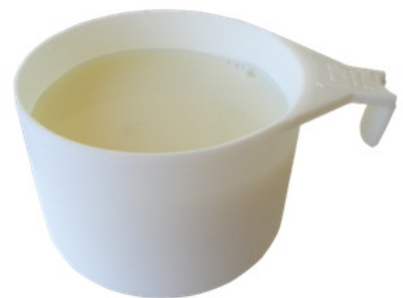
¾ serve of light milk