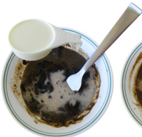
4 Add ¼ cup of milk