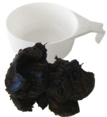
½ serve of fruit