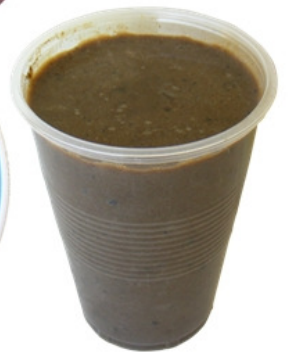
7 Pour into a cup