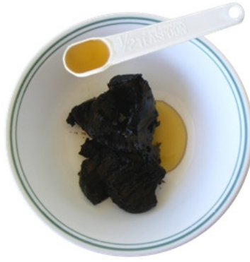
2 Add ½ teaspoon of honey