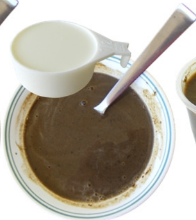
6 Add ½ cup of milk and mix