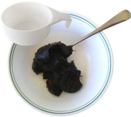
1 Place ½ cup chocolate pudding fruit in a bowl