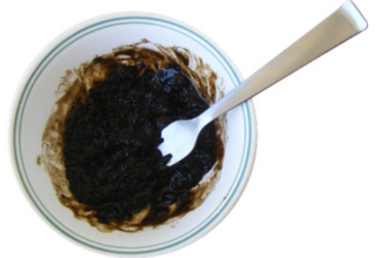
3 Mix into a paste