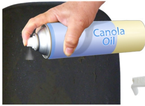
11 Spray frying pan with oil (You may need to oil the pan after cooking each pancake)