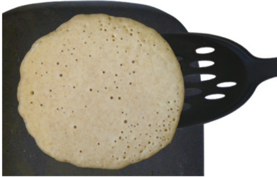
13 Watch the bubbles. When the pancake is cooked gently slide the spatula underneath