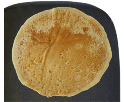
15 Flip again to see if it is cooked underneath