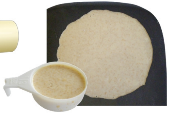
12 Measure 1/3 cup of mixture & pour into frying pan