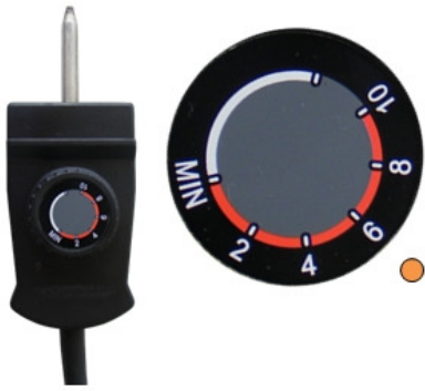
10 Turn the frying pan thermostat to 6