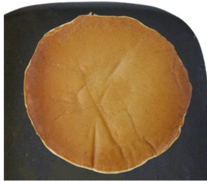
14 Flip the pancake