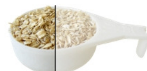
1/2 serve cereal