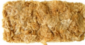
1 Weetbix or any wheat biscuit

1½ apples make about 2 cups of diced apple