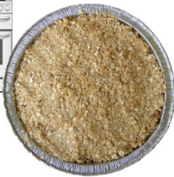
11 Bake in the oven for 30 minutes.