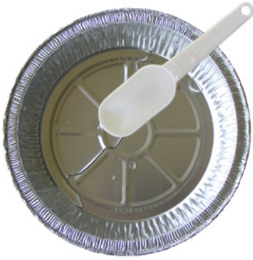
8 Add 1 tablespoon of water to the tray