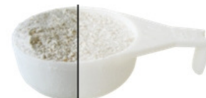
1/2 serve cereal