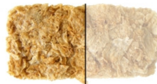
1/2 serve cereal