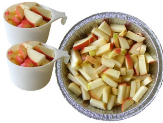
9 Add 2 cups of apple