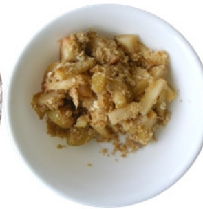
12 Serve with custard