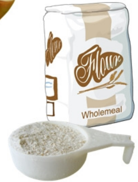
¼ cup wholemeal flour (can be self raising)