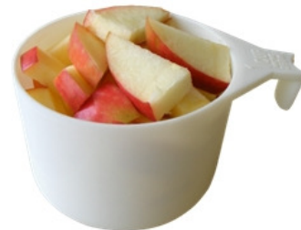
1 serve of fruit