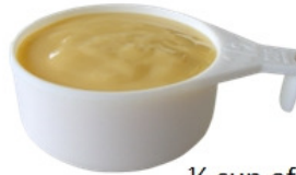
½ cup of custard