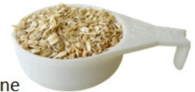
¼ cup quick oats