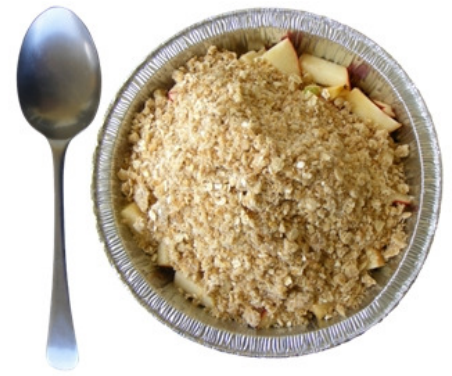
10 Spread topping over apples