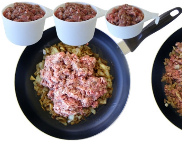
7 Add mince