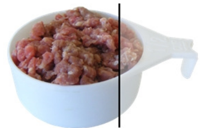
Almost 1 serve of minced meat