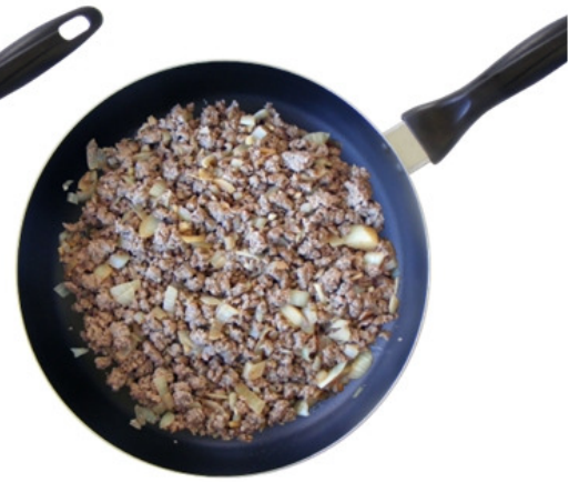
9 Cook meat until it is brown right through