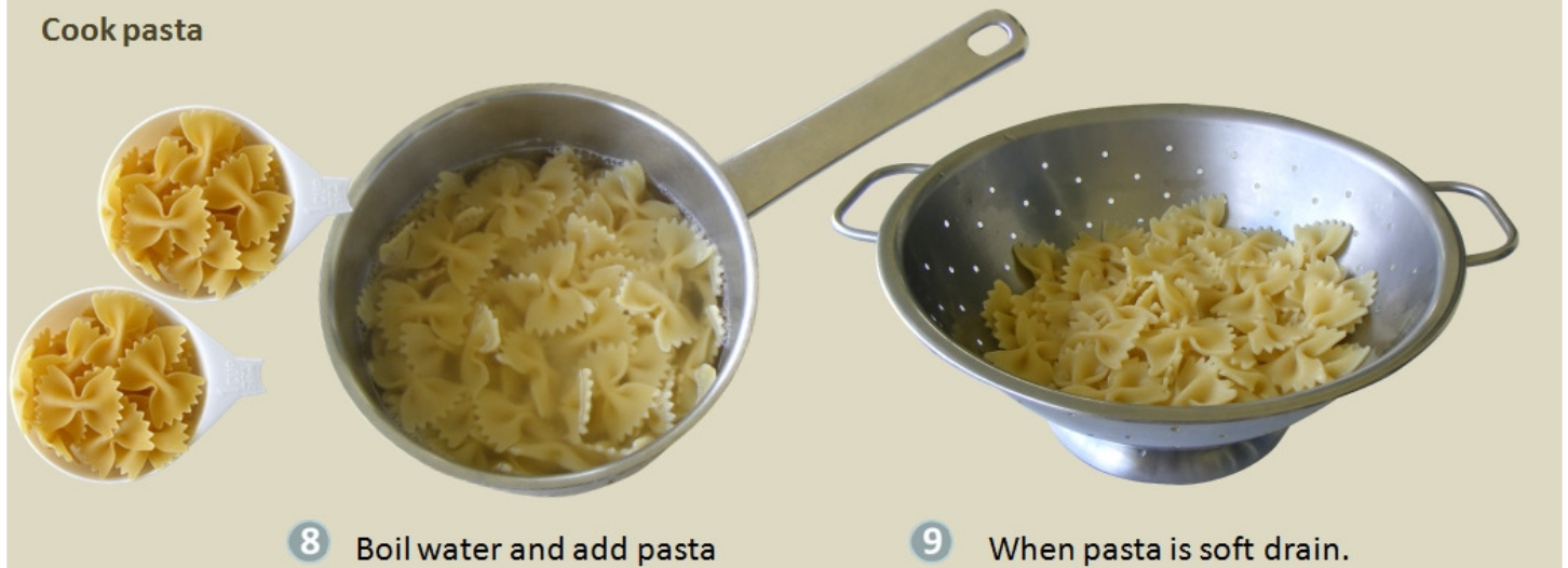
8 Boil water and add pasta