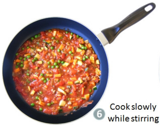
6 Cook slowly while stirring