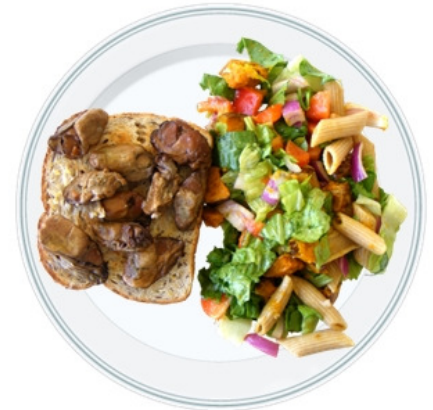
10 Serve with toast and smoked oysters