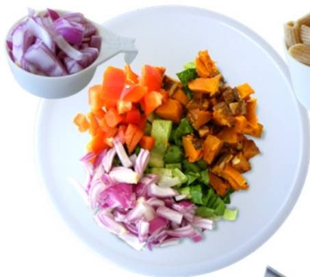
5 Add red onion