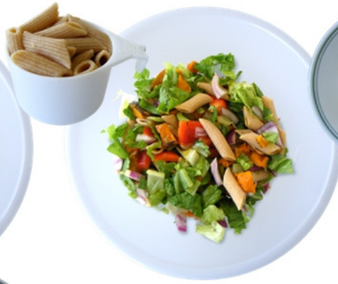
6 Add pasta