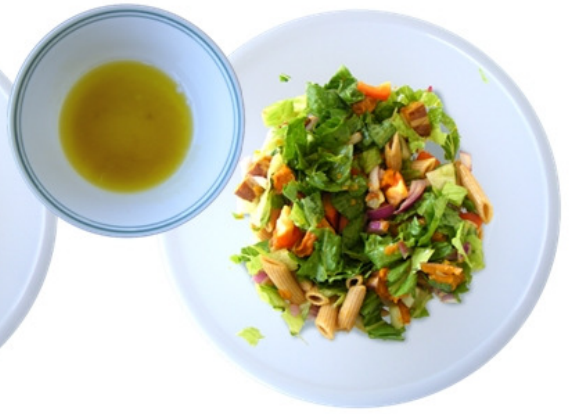
7 Add dressing