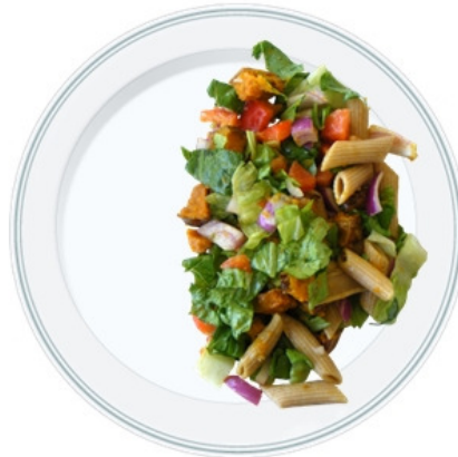
9 Place half of the salad on a plate