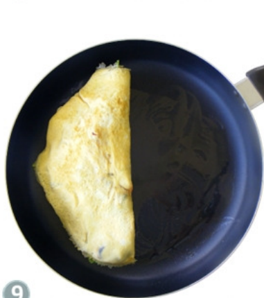
9 Fold the omelette over and cook