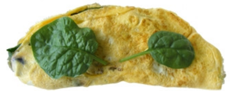
12 Garnish with baby spinach