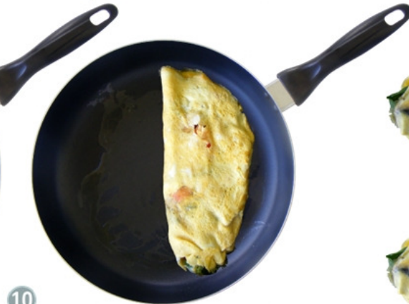
10 Flip omelette over and cook some more