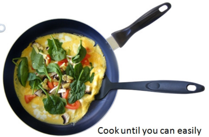
8 Cook until you can easily slide a spatula under the omelette