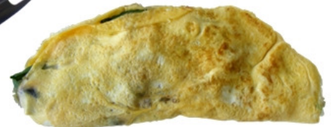
11 Serve omelette