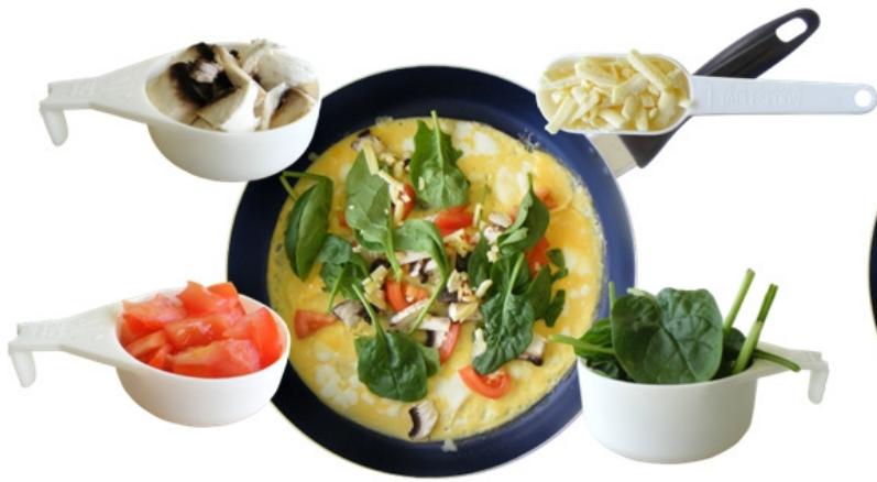
7 Add tomatoes, mushrooms, spinach and cheese