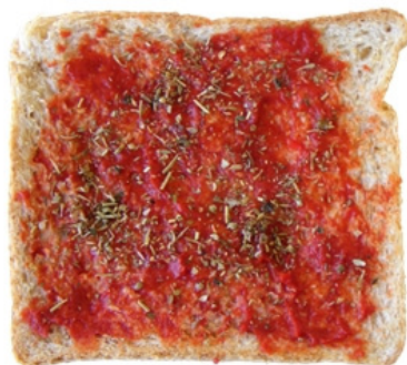
Sprinkle herbs on top