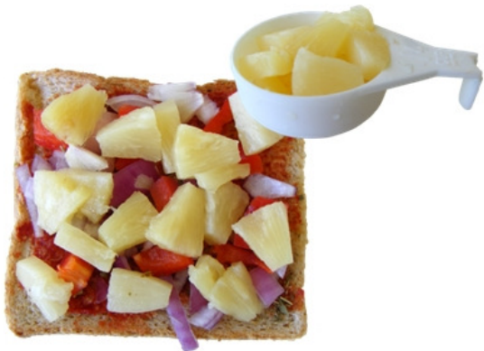
5 Add pineapple