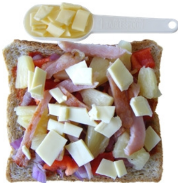
6 Add cheese