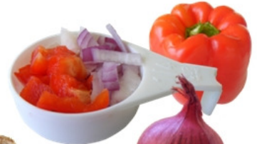
1/4 cup of vegetables