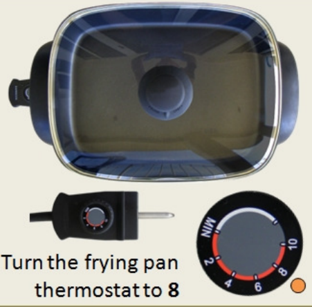
Turn the frying pan thermostat to 8