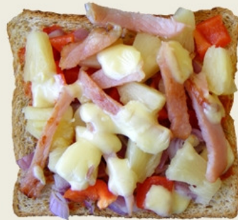
7 Bake then serve