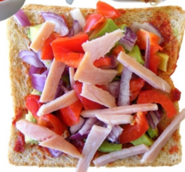
Add vegetables and meat