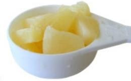
1/4 cup of fruit