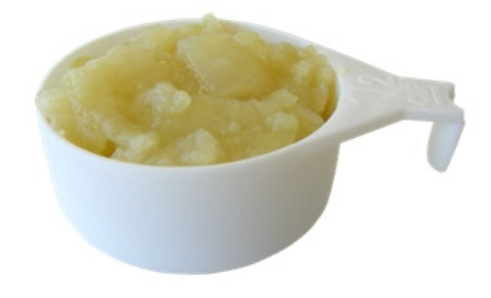
1/2 serve of fruit