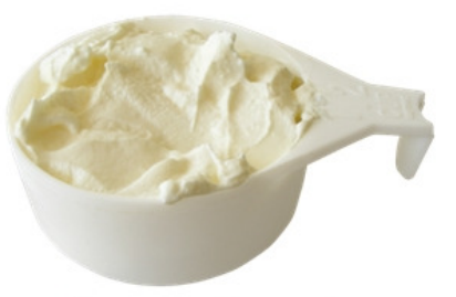
½ serve of yogurt