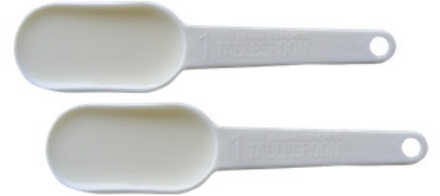
2 tablespoons of milk