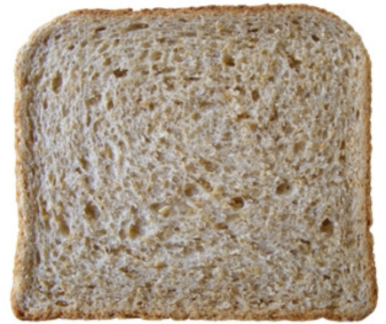
1 serve of bread