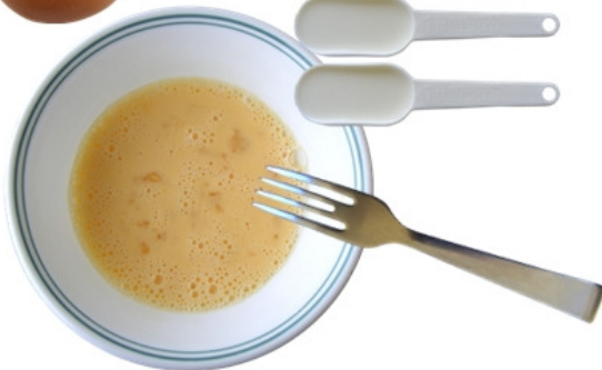
1 Whisk egg and milk mixture with a fork