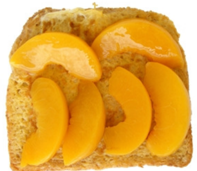
6 Serve with fruit