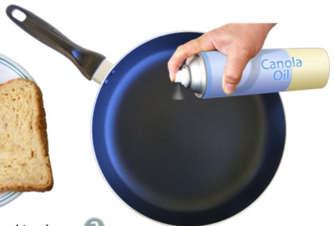
3 Spray the frying pan with oil