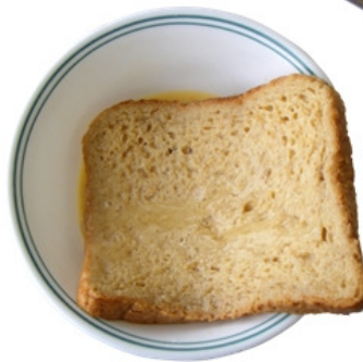
2 Soak the bread in the egg and milk mixture