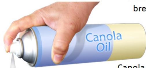
Canola oil spray