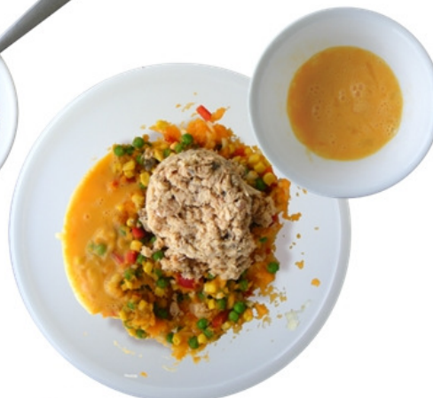
4 Add whisked eggs