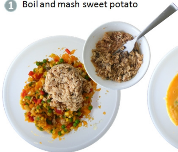
3 Add 1 cup mashed tinned fish