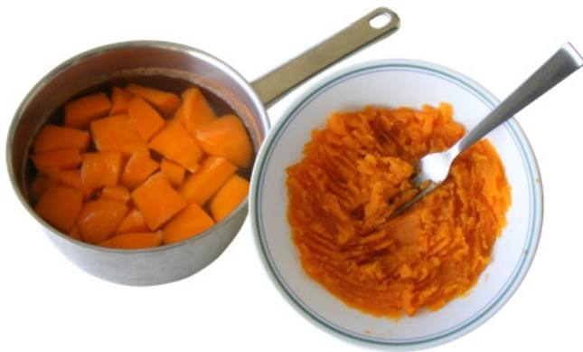
1 Boil and mash sweet potato