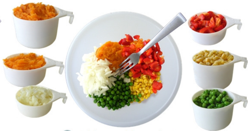
2 Add vegetables and mix