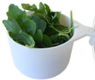
17 Arrange 1 cup of rocket or lettuce around the fettuccini