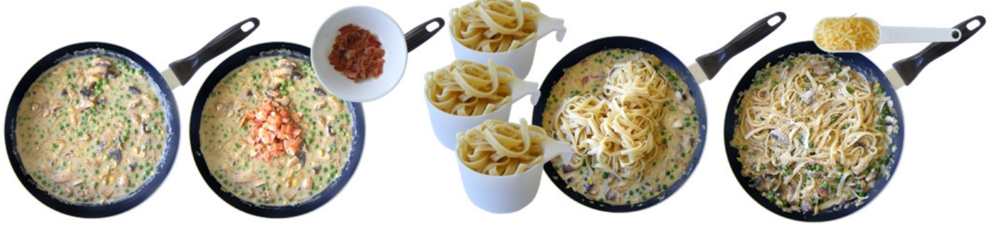
12 On low heat cook until sauce thickens