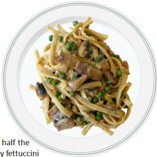
16 Put half the creamy fettuccini on a plate