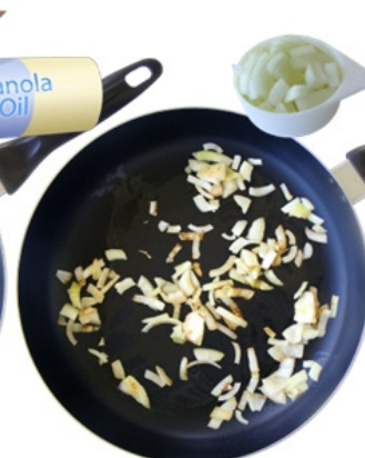
5 Cook onions until they are soft and turning brown