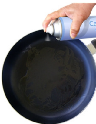
4 Spray frying pan with canola oil