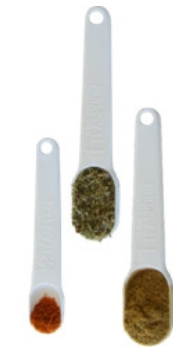
2 Add chilli powder, Italian mixed herbs and cumin (or curry) powder