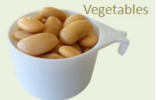
1 cup buttered beans