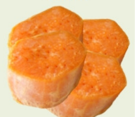
4 pieces micro-waved sweet potato