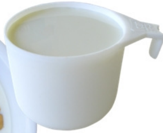
6 Add milk and mix