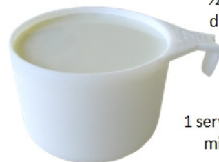
1 serve of milk