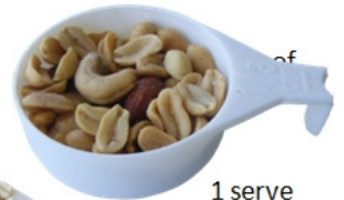
1 serve of nuts

Serves in 1 bowl of cereal, nuts & fruit