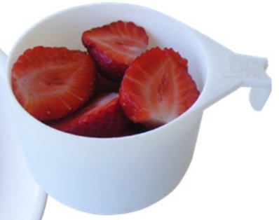
5 Add fruit