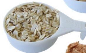
2 serves of cereal