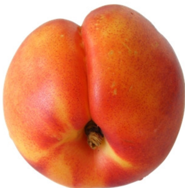
Yellow flesh nectarine