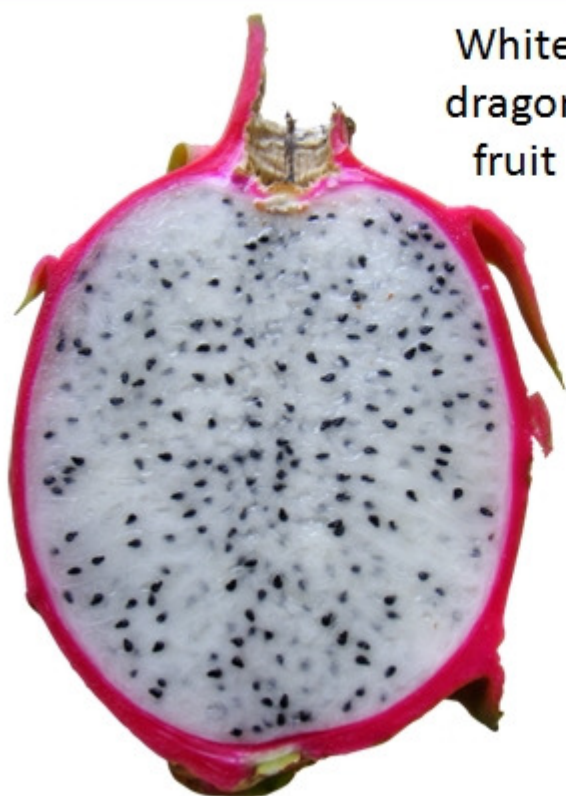
White dragon fruit