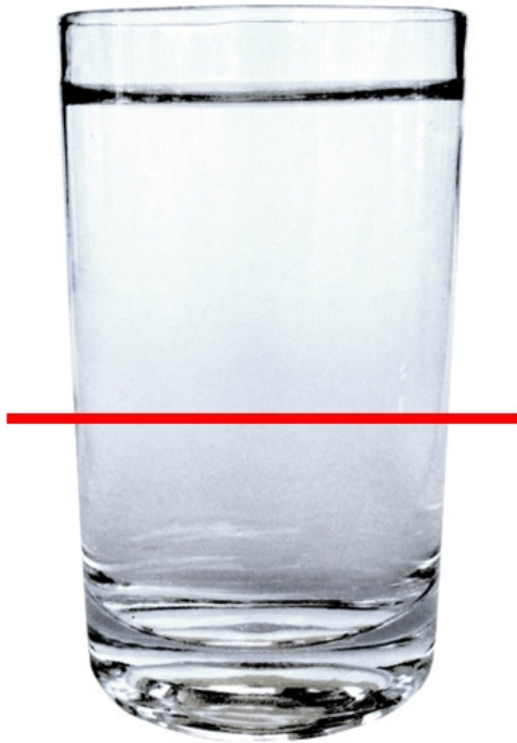
Marking your glass