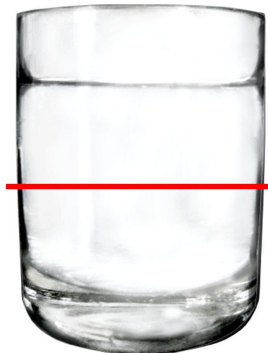
Marking your glass