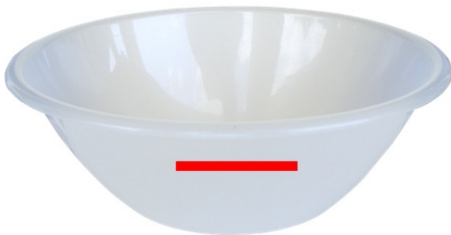
Marking your bowl