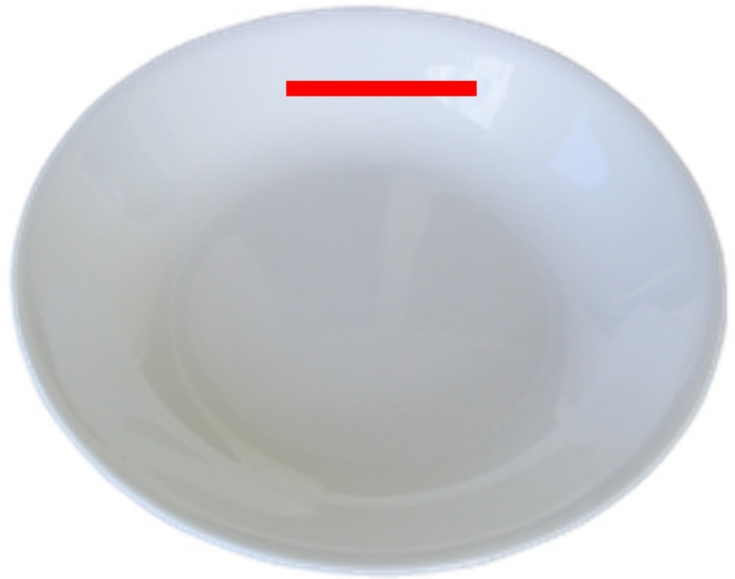
Marking your bowl