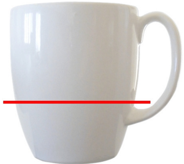
Marking your mug