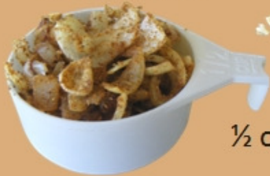
½ cup cooked onions