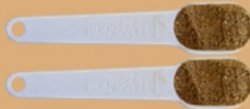
2 teaspoons of curry powder