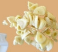
2 or 3 cloves of garlic