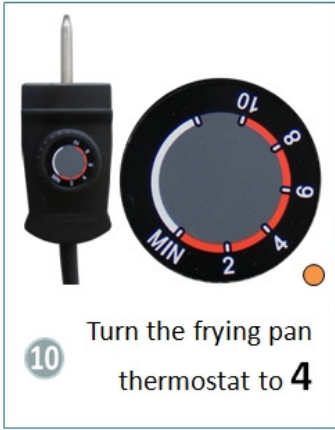
10 Turn the frying pan thermostat to 4