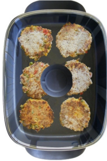
13 Fry until cooked