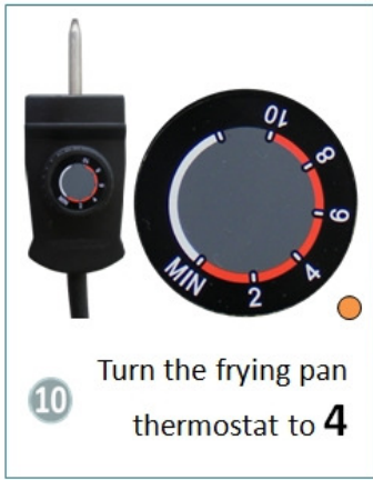
10 Turn the frying pan thermostat to 4