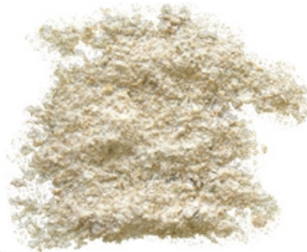
7 Dust board with flour mix