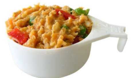
½ cup of vegetables