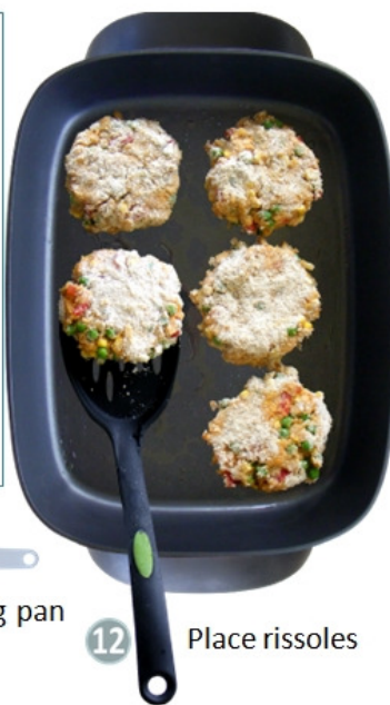
12 Place rissoles