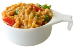
6 Measure ½ cup rissole mix