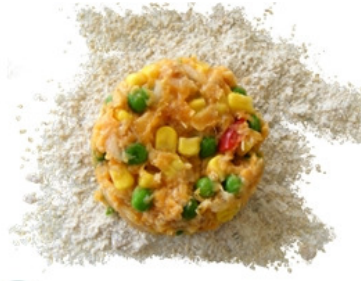
8 Place rissole mix on flour