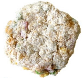
9 Shape rissole