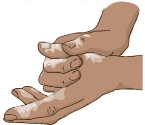
4 Around thumbs