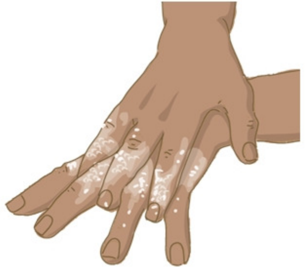
2 Back of hand