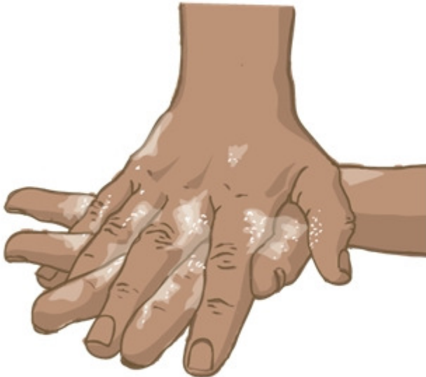
3 Between fingers