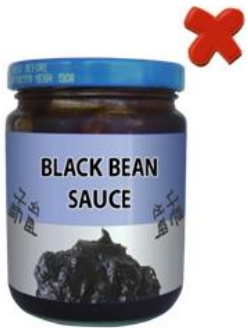
Black bean sauce