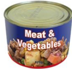
Tinned meat & vegetables