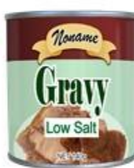
Low salt gravy