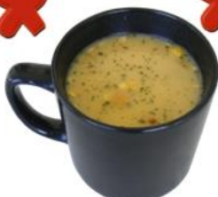
Cup of soup