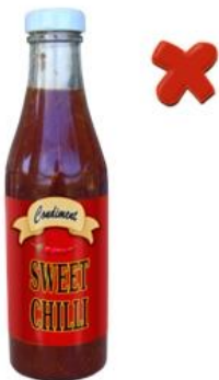
Sweet chilli sauce