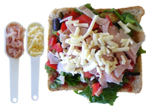
7 Add ham & cheese