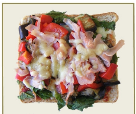
8 Bake then serve