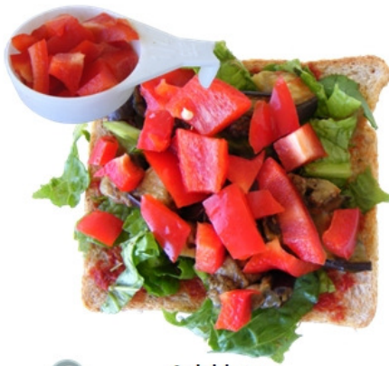
6 Add ham