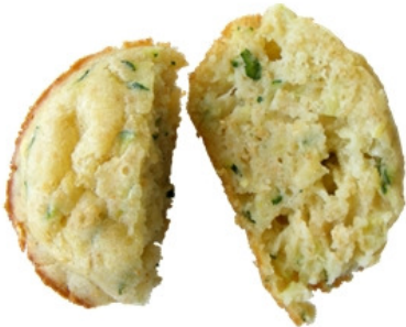
Zucchini & cheese