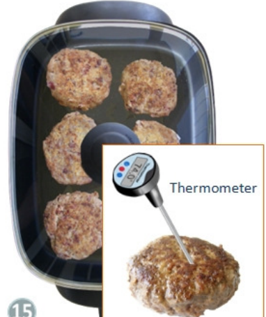
15 Cook the pate on both side to make sure it is cooked all the way through