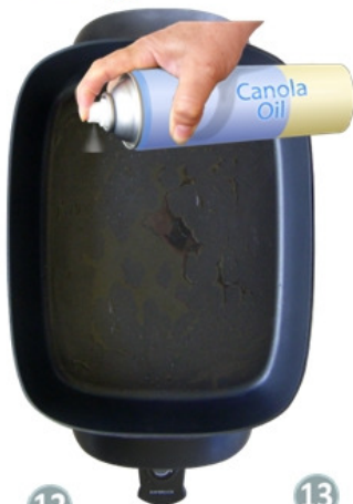
12 Spray frying pan with oil