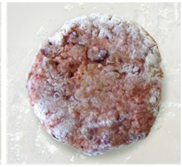
11 Flatten patty