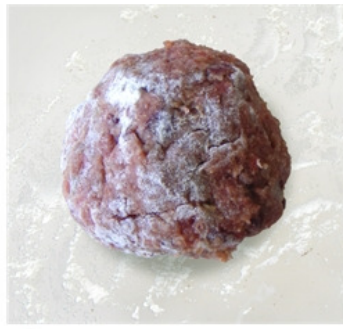
10 Dust with flour and roll into a ball