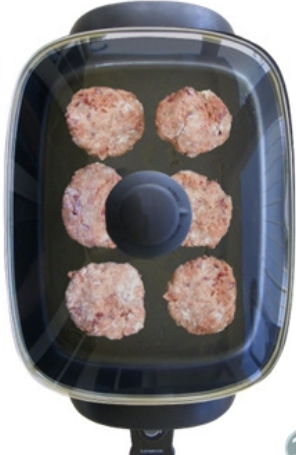
13 When the frying pan is hot carefully add the patties. Cover with lid