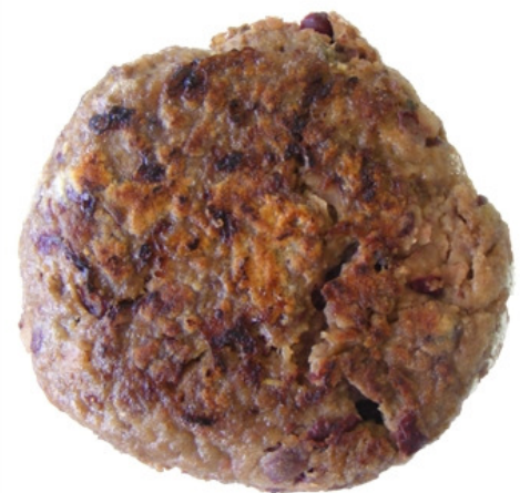
½ serve of protein (meat and vegetable)