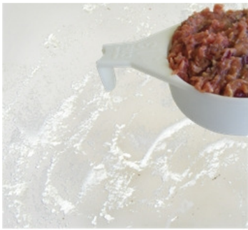
8 Dust board with flour Cooking