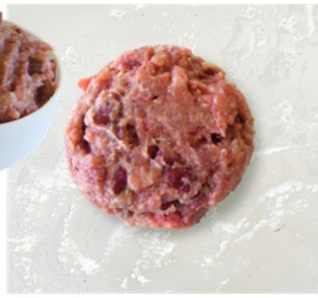
9 Measure 1/3 cup of raw bean & meat mix