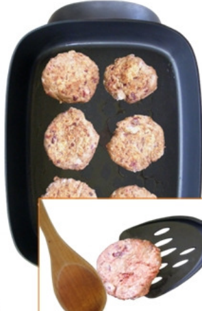
14 Cook the patty for 5 minutes. Then push the pates on to the spatula and flip them