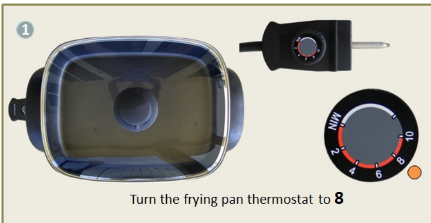
Turn the frying pan thermostat to 8