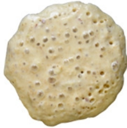
Wait till you see bubbles