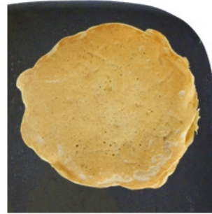
13 Flip hot cake