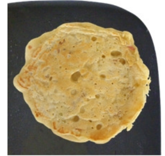
14 Cook other side then flip and check it is cooked