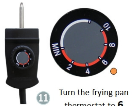
11 Turn the frying pan thermostat to 6