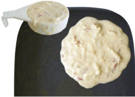
12 Measure 1/3 cup of mixture and pour into frying pan