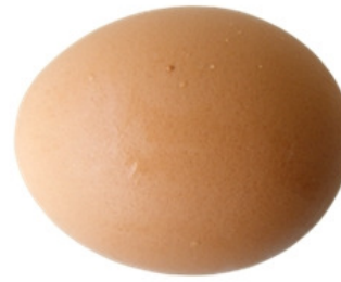
1 large egg