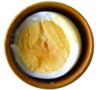
Hard boiled eggs need 8 minutes simmering