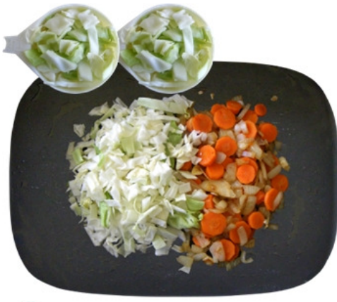
8 Add cabbage