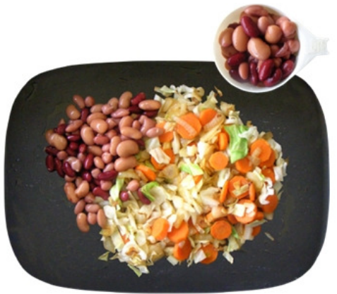
10 Add mixed beans