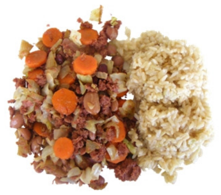
13 Serve with cooked brown rice