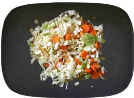
9 Cook for 5 minutes