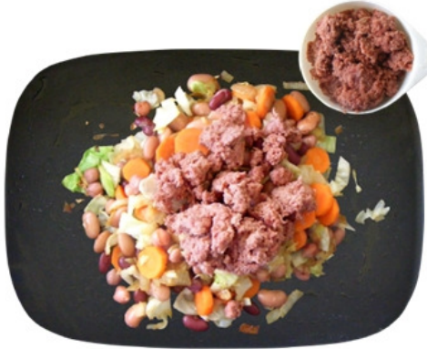
11 Add corned beef