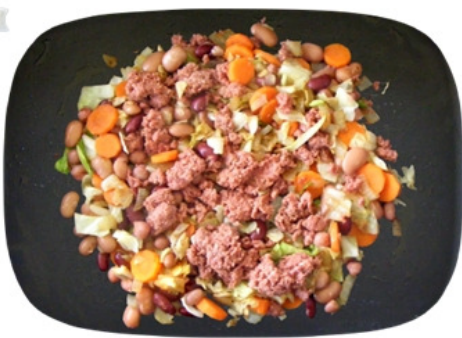
12 Cook for 5 minutes