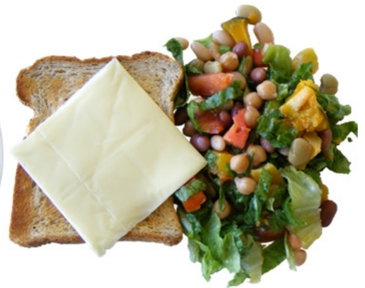
9 Serve with toast and cheese