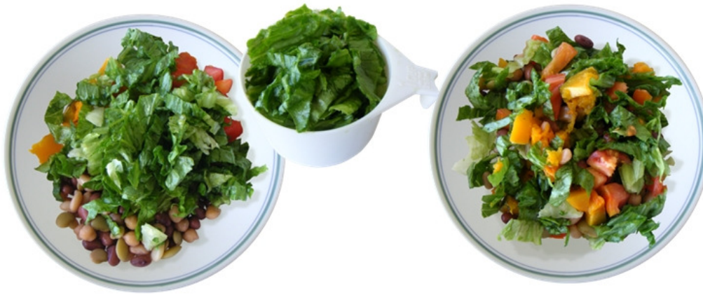
5 Add lettuce