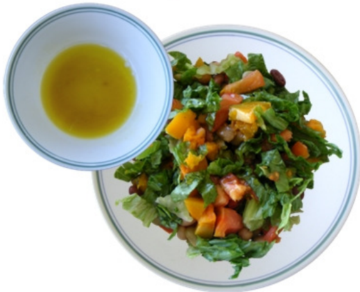
7 Pour dressing on salad