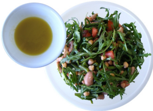
8 Pour dressing onto salad and mix