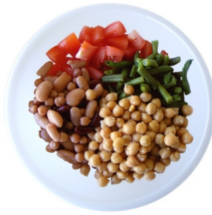
6 Add chickpeas