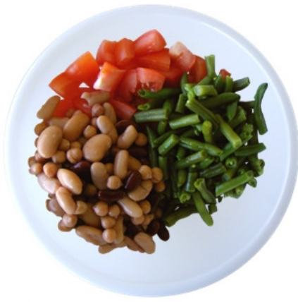
5 Add mixed beans