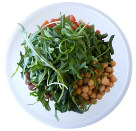
7 Add rocket or lettuce