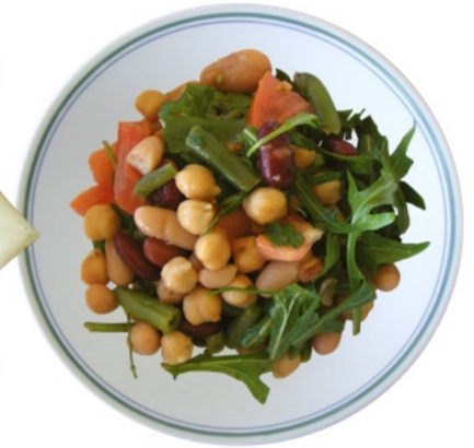
9 Serve with toast and cheese