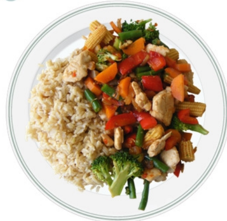
8 Serve with brown rice or noodles