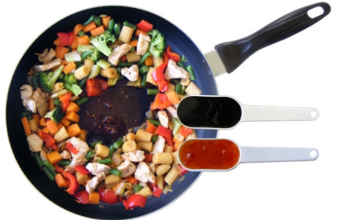
6 Add soy and chilli sauce