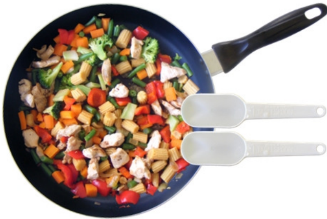
5 Add 2 teaspoons of water and cook vegetables