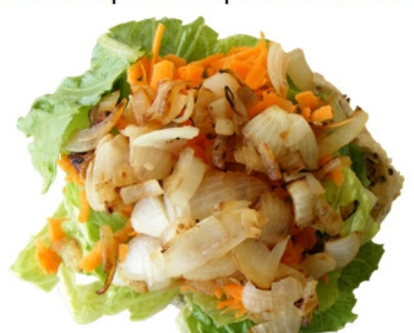
5 Place 1/4 cup of fried onions