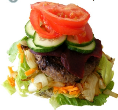
9 Place sliced tomato