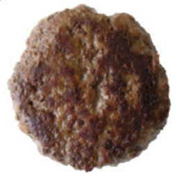
1 cooked meat patty