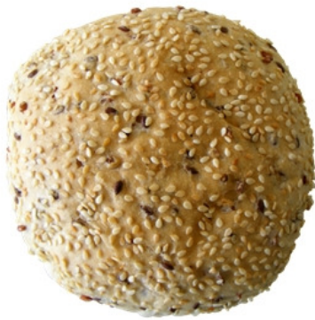
1 Cut bread roll into 2