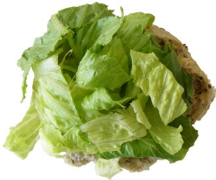
3 Place 1/2 cup of lettuce