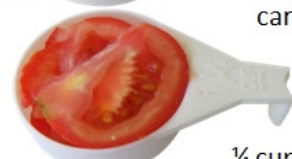
1/4 cup sliced tomato