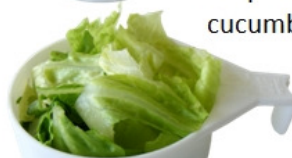
1/2 cup lettuce