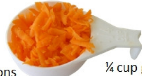
1/4 cup grated carrot