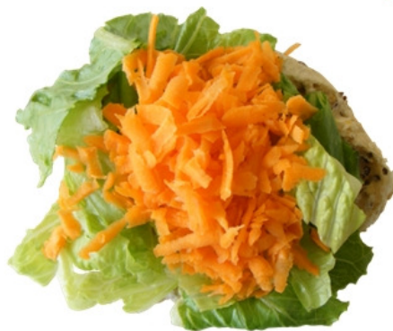
4 Place 1/4 cup of grated carrot