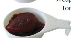
1/4 cup tinned beetroot