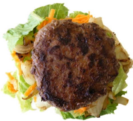
6 Place cooked meat patty