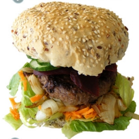
10 Place top of roll on top