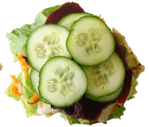
8 Place sliced cucumber