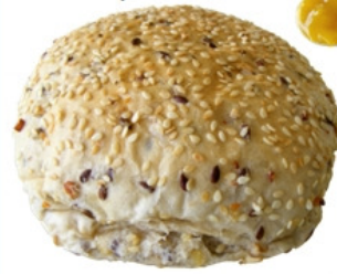
Bread roll – either wholemeal or multigrain