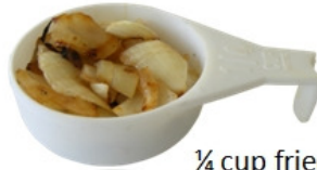
1/4 cup fried onions