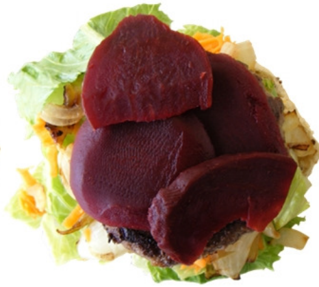
7 Place tinned beetroot