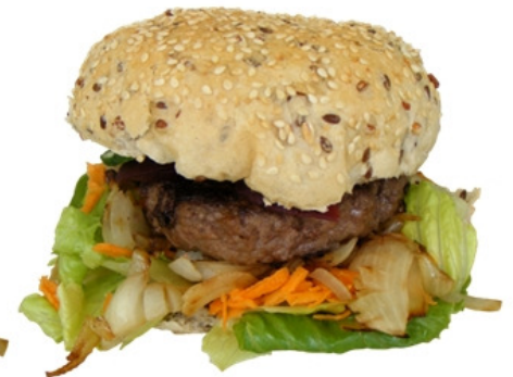
11 Gently push down