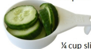
1/4 cup sliced cucumber