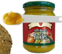
1 or 2 teaspoons of pickle or relish