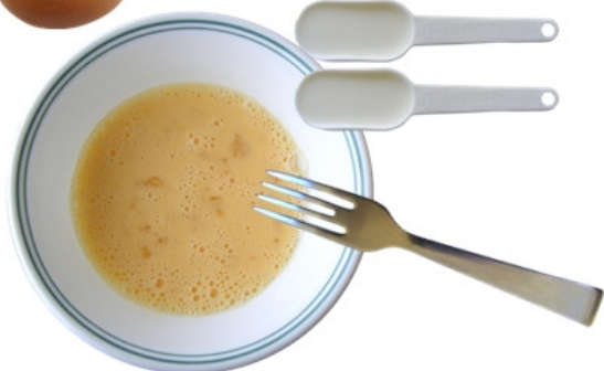
1 Whisk egg and milk mixture with a fork