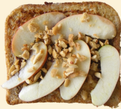
You can add nuts