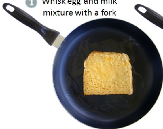
4 Fry the bread