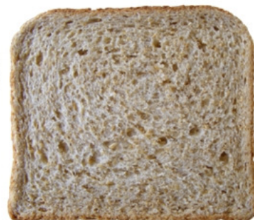
1 slice of bread