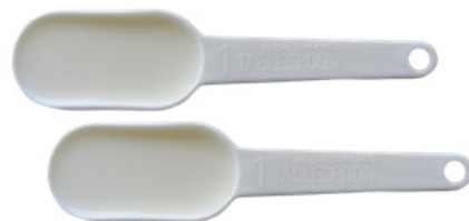
2 tablespoons of milk