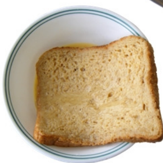
2 Soak the bread in the egg and milk mixture