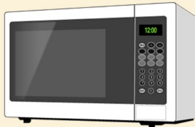
Microwave fresh fruit