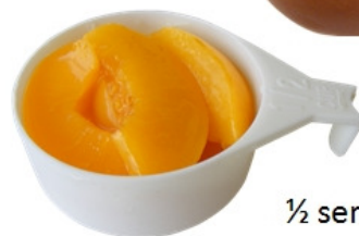
1/2 serve of fruit