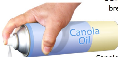
Canola oil spray