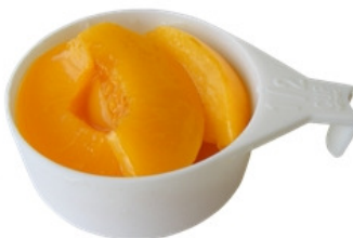
1/2 cup of fruit