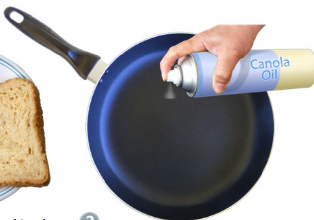
3 Spray the frying pan with oil