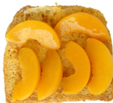
6 Serve with fruit