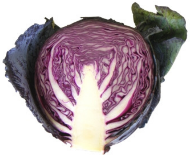
Dwarf red cabbage