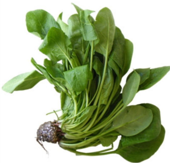
Hydroponic English spinach