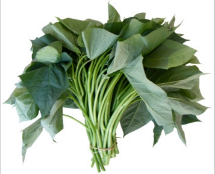
Sweet potato tops