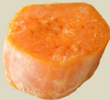
Sweet potato micro-waved