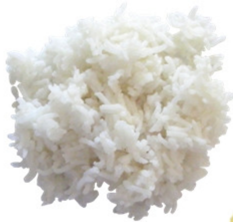
Boiled white rice