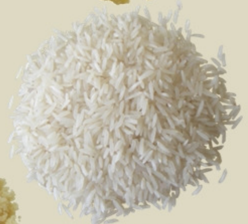
Long grain rice