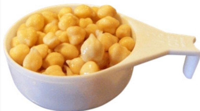
1 serve chickpeas