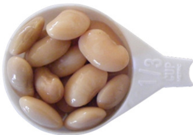
1 serve butter beans