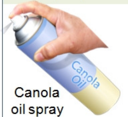
Canola oil spray