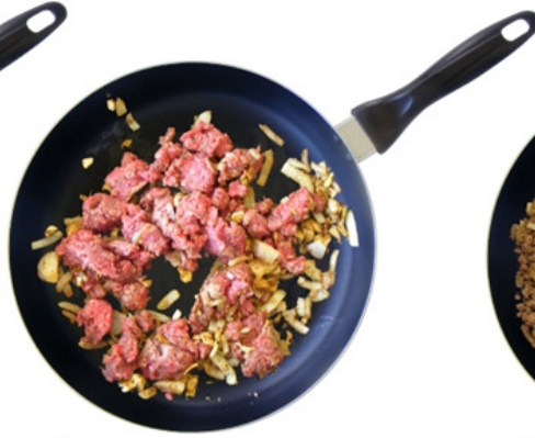
9 Mix mince with onions and cook