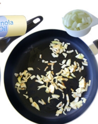
5 Cook onions until they are soft and turning brown