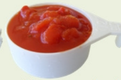
1/2 cup crushed tinned tomatoes