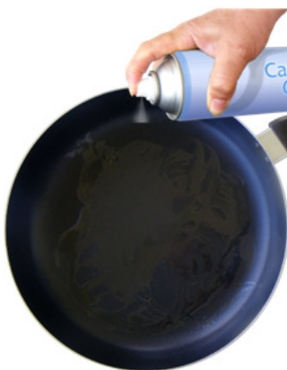
4 Spray frying pan with canola oil