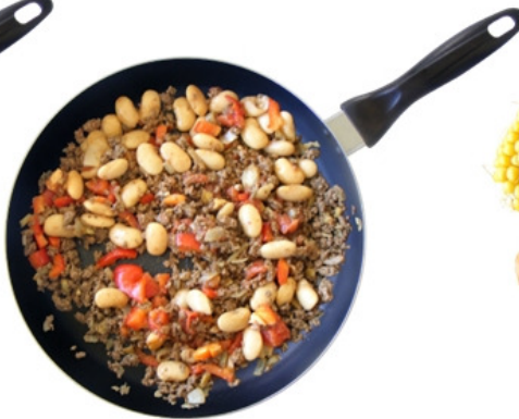
12 Mix and cook until capsicum is soft