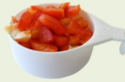
1/2 cup capsicum