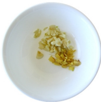
1 Place garlic and ginger in a bowl