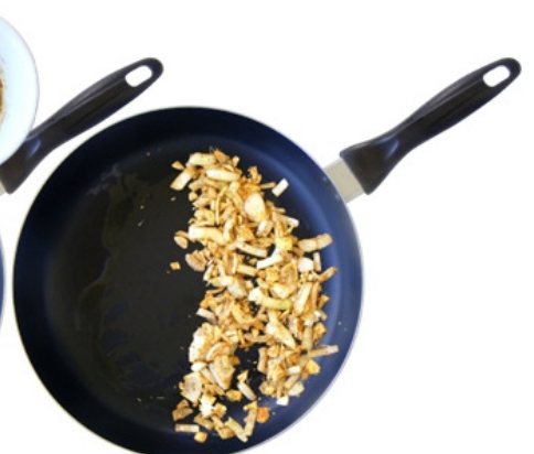
7 Cook on low heat for about 5 minutes then push to one side