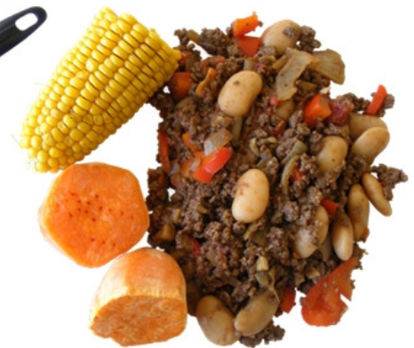
13 Serve half with corn and baked sweet potato