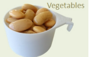
1 cup buttered beans