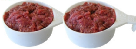
2 x 1/2 cup minced beef