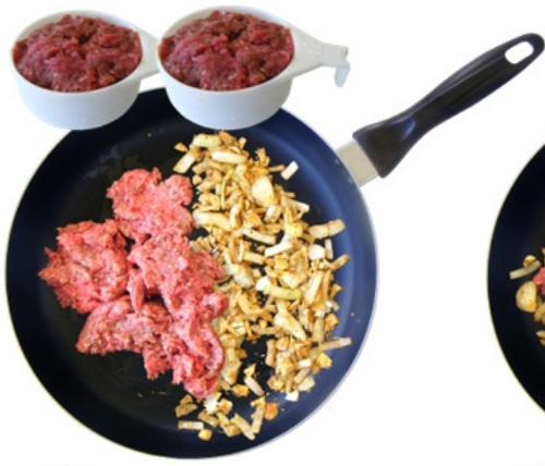
8 Add mince