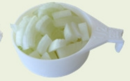
1/2 cup chopped onions