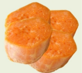
4 pieces micro-waved sweet potato