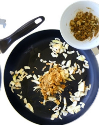
6 Add spice mix