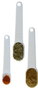
2 Add chilli powder, Italian mixed herbs and cumin (or curry) powder