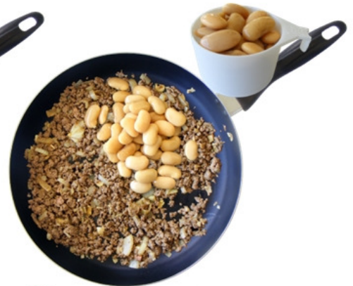
10 When the meat is brown, add tinned beans