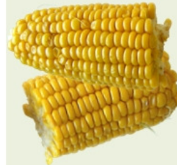
2 pieces micro-waved corn on the cob