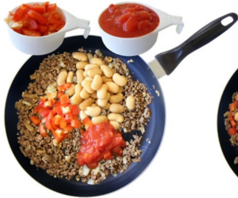
11 Add capsicum and tomatoes