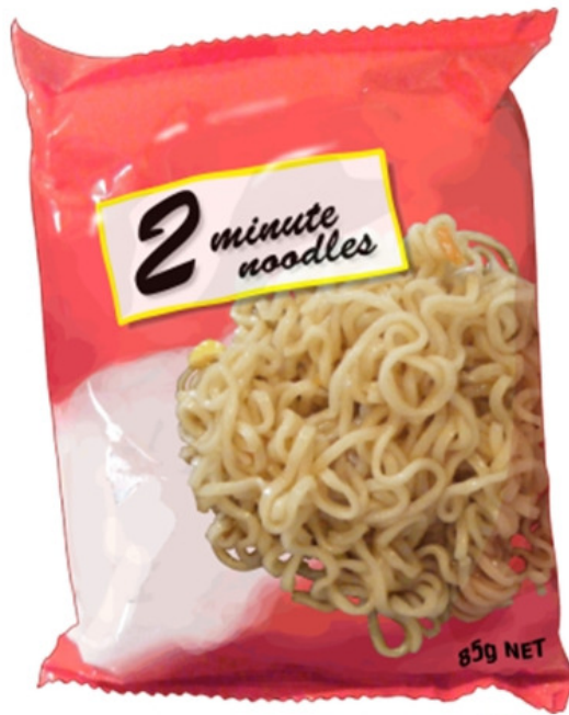
2 minute noodles