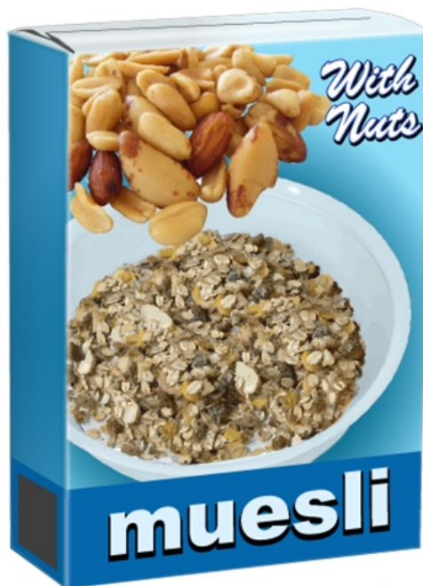
Muesli with nuts