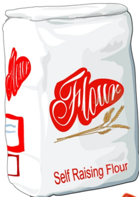
Self raising flour