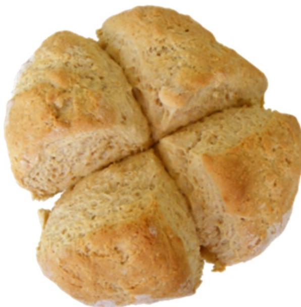
Damper made with self raising flour