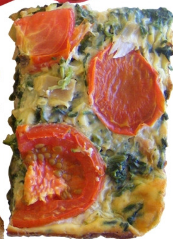
No pastry quiche